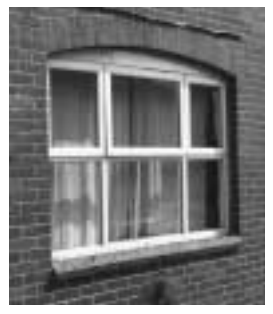
Incorrect construction using conventional DPC. Introduced in the first available horizontal run, this arrangement is suspect because it leaves a considerable amount of brickwork between window and DPC which is unprotected.

The Type BA barrier arch is a DPC, supplied ready-shaped to suit the arch opening. The Type BA is incorporated within the cavity wall with its base section positioned on the traditional centring.